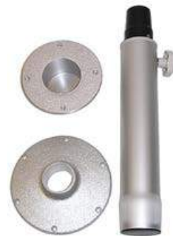
ADJUSTABLE TABLE PEDESTAL 001382 Stowable table pedestal, telescopic, swivels 360°. and one hand adjustable. OD 80mm. Max height 830mm Min height 470mm.