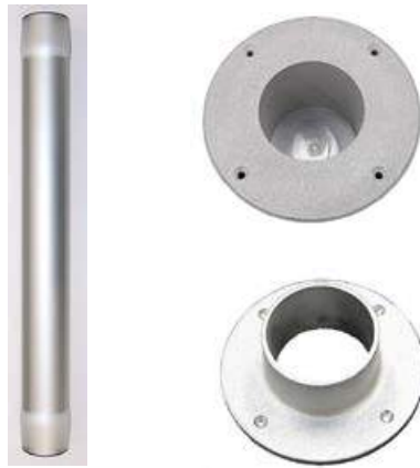
TABLE PEDESTAL - HEAVY DUTY COMPLETE