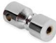
COFFEE TRAY RAIL PILLAR THROUGH 000696 Nickel plated.