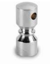
COFFEE TRAY RAIL PILLAR END 000697 Nickel plated.