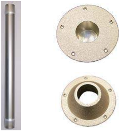
TABLE PEDESTAL - MEDIUM DUTY COMPLETE