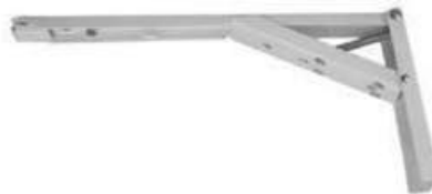
FOLDING TABLE BRACKET 000342 Extends any bench top. Sold Individually - Recommended 2x per table top. Dimensions: 300mm(L) x 140mm(h)