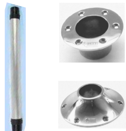
TABLE PEDESTAL - LIGHT DUTY COMPLETE