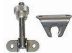
SWINGING BOLT 000340 38mm.