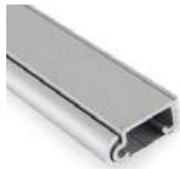
ALUMINIUM TABLE SUPPORT 000329 MALE 000330 FEMALE 4m lengths.