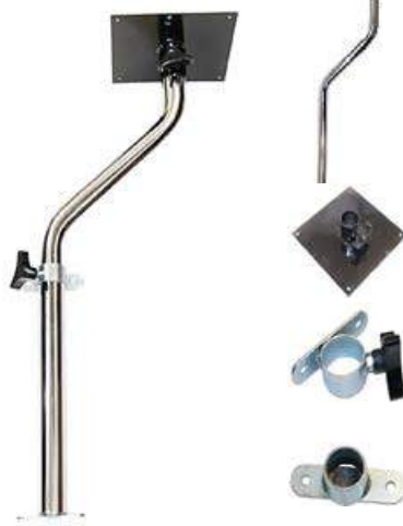
SWING AWAY TABLE PEDESTAL 000312 SET 000313 TUBE ONLY 000314 PLATE 000315 COLLAR 000316 FLOOR FLANGE 000317 HANDLE FEMALE 000318 HANDLE MALE