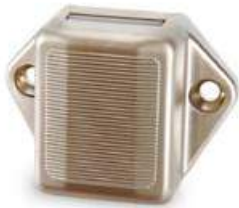
MINI PUSH LOCK 000361 Nickel.