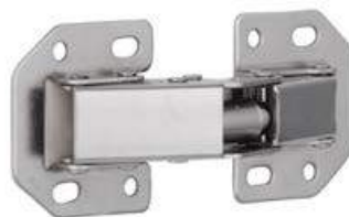
HINGE OVERHEAD 90° 002720 Nickel.