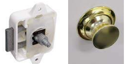
PUSH LOCK KITS 003290 PUSH LOCK 13MM NICKEL KIT 001412 PUSH LOCK CATCH NICKEL 16MM KIT 001417 PUSH LOCK CATCH 19MM NICKEL KIT 001419 PUSH LOCK CATCH BRASS 19MM KIT 003286 PUSH LOCK ROSETTE 13MM NICKEL 003291 PUSH LOCK ROSETTE 13MM BRASS 001411 PUSH LOCK ROSETTE 16MM NICKEL 001416 PUSH LOCK ROSETTE 19MM NICKEL 001418 PUSH LOCK ROSETTE 19MM BRASS 001423 STRIKER PLATE 003289 PUSH LOCK CATCH PUSH BUTTON WHITE 001424 PUSH LOCK DOUBLE SIDED CATCH WHITE 003287 PUSH LOCK KNOB BRASS 003288 PUSH LOCK KNOB NICKEL