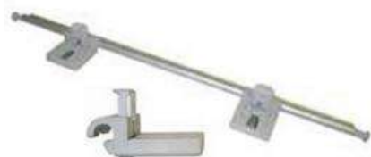
TABLE SLIDE RAIL SET 000333 SET 000334 BRACKET ONLY Set consists of: 2 brackets, 1 length alloy track 950mm, 2 end plugs.