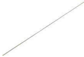
COFFEE TRAY RAIL 000695 • 1.8m