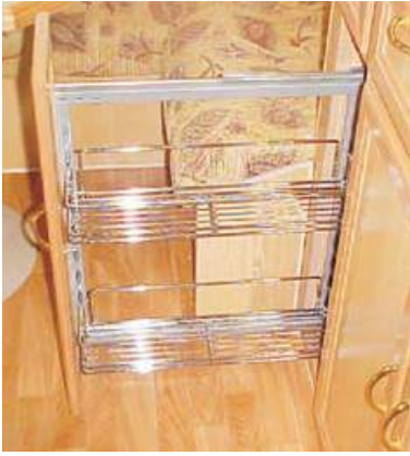
ROLL OUT PANTRY 2 X 110MM 000005 2 X 110MM WIDE BASKETS 000008 2 X 200MM WIDE BASKETS 000900 3 X 200MM BASKET PANTRY 730MM (H) 000007 110MM BASKET ADDITIONAL 000009 200MM BASKET ADDITIONAL